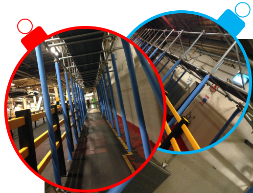
B Block Ovens Internal Scaffold