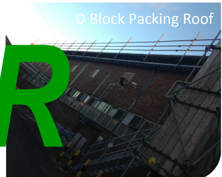
D Block Packing Roof