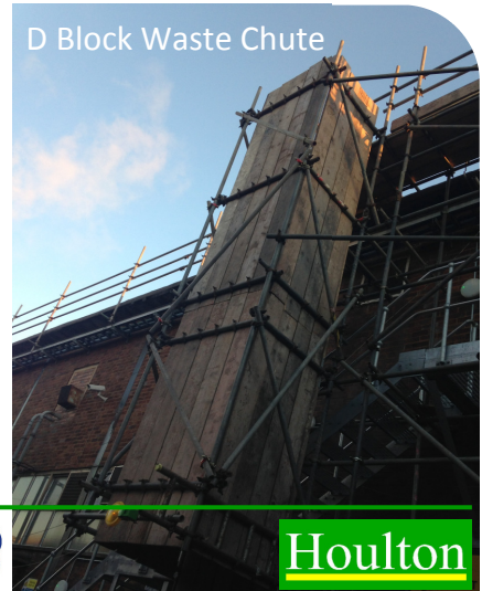
D Block Waste Chute

To enable the removal of waste from the roof area, a waste chute has been erected to the side of the erected scaffold.